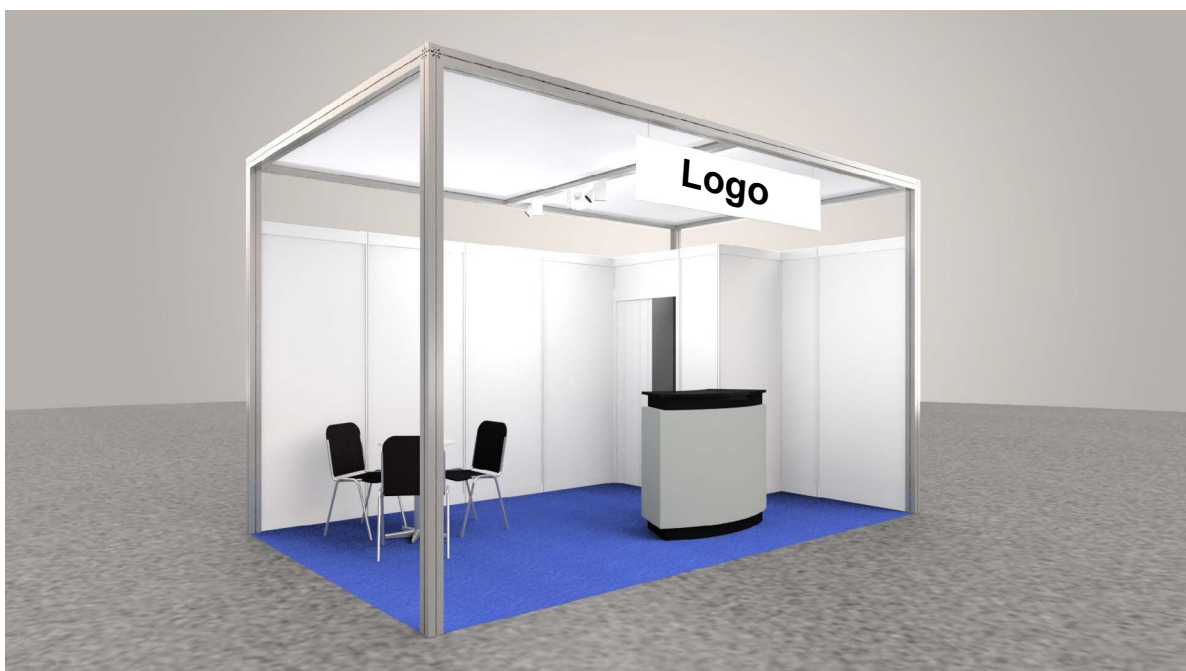
Example picture corner stand PRESTIGE 5x3m