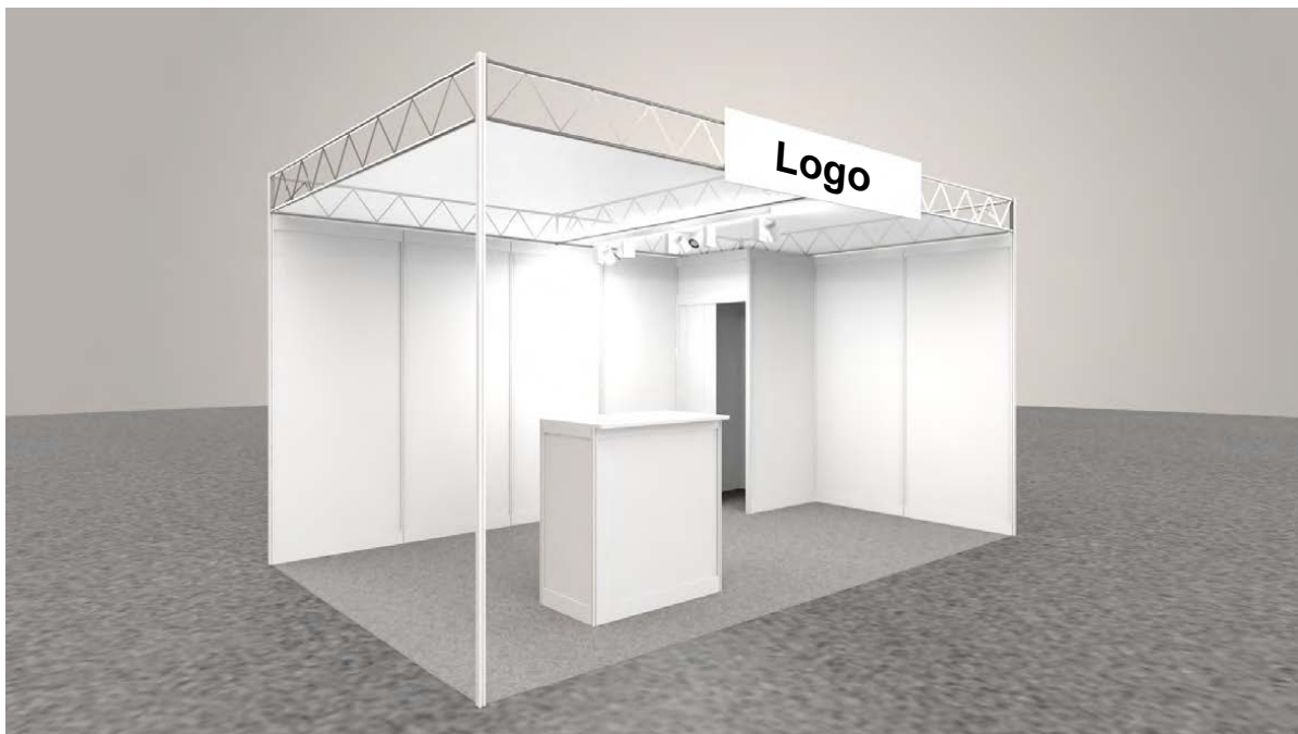
Example picture corner stand PLUS 5x3m, 2 sides open