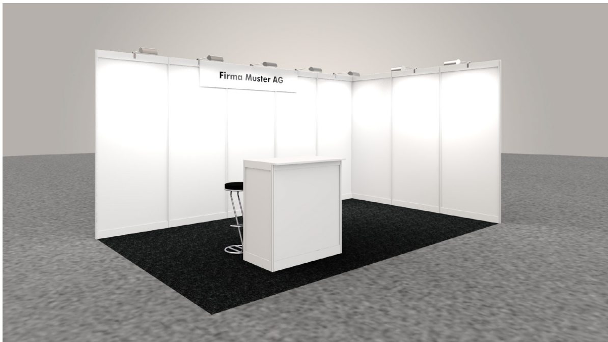
Example picture SMART 5x3m, 2 sides open